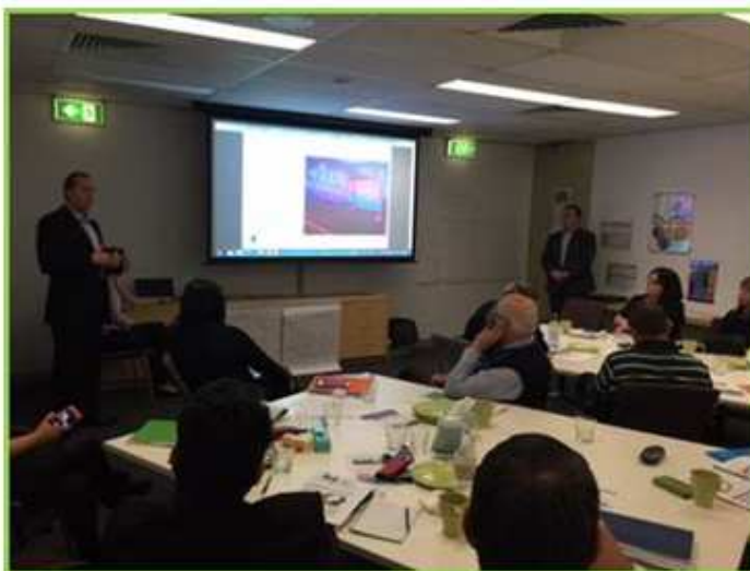
August 2015: Telstra Insight Centre Presentation

First though, the RCFC have been busy during the month of August and are keen to share updates and developments, following on from their last meeting on 12 August 2015.